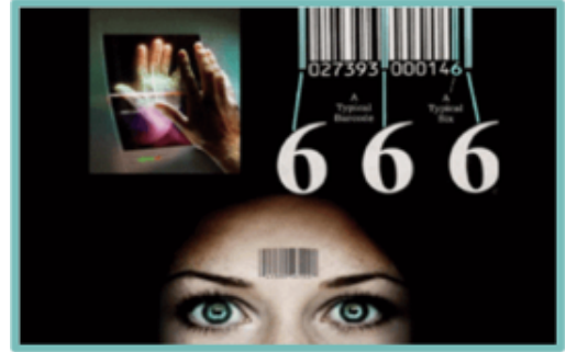
The Mark of the Beast

Chapter 14:8 “Babylon speaks to the great whore of money, and those who have worshipped it rather than God. This speaks to all in the world who fell under its trance, and became seduced by the gods of self, pleasure, luxury, lust, and all that which adores evil. At this point...it falls. There is great bloodshed in chapter 14—for then the sides are chosen and the harvest is taken. Those who take the ‘Mark’, are amongst the harvest and they will suffer torment eternally.”